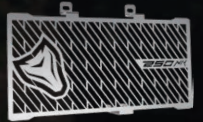
RADIATOR PROTECT NET