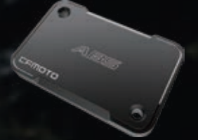
BRAKE CLUTCH OIL CUP COVER