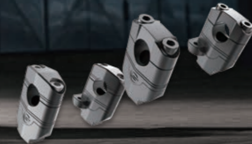
HANDLEBAR HEIGHTENING BLOCK