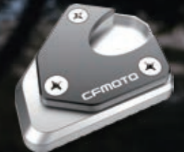
ENLARGED SIDE SUPPORT PEDESTAL