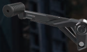
ADJUSTABLE SHIFT ROD