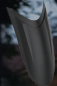
FRONT LENGTHENED FENDER